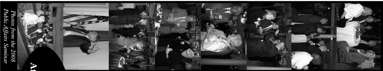
Photos from the 2008 Public Affairs Seminar

FIRST TIME ATTENDEE DISCOUNT: First time attendees of the Public Affairs Seminar can take $50 off their seminar registration.